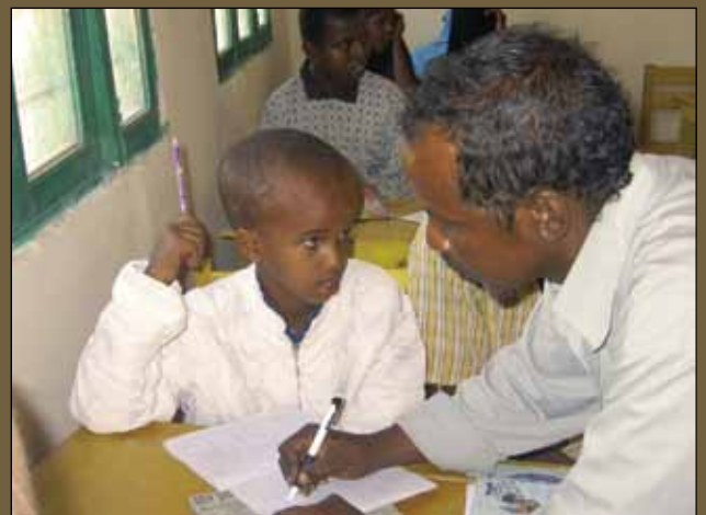
One of the Special Needs Education children receiving instruction from a teacher in one of the IAS SNE Centers.