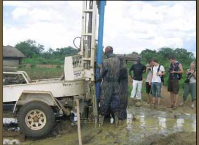
Trainees watching how drilling is done!