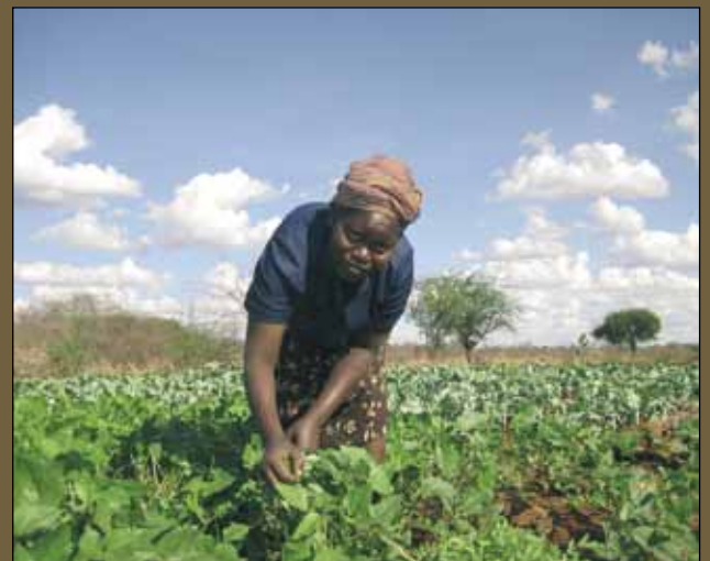
See what the gravity flow irrigation project has done in Marimanti Tharaka District in Kenya.